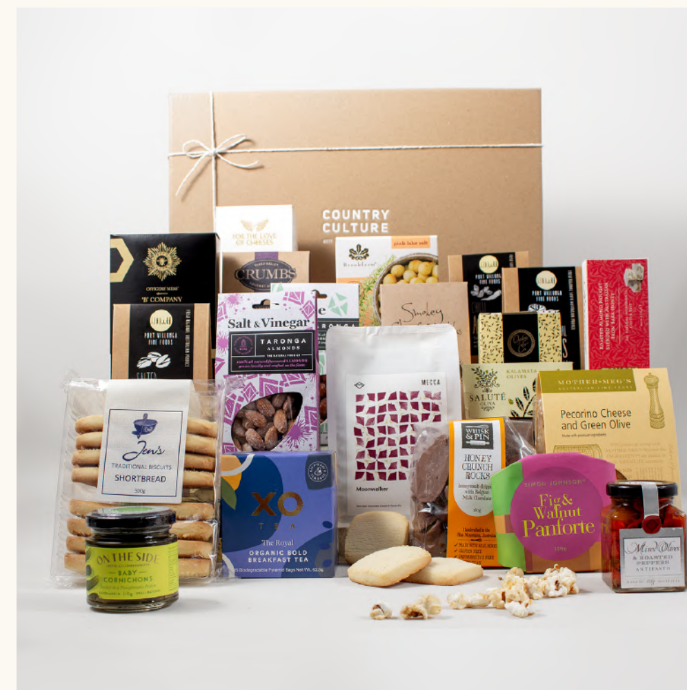
EMPOWERMENT AND APPRECIATION SHARE HAMPER $205