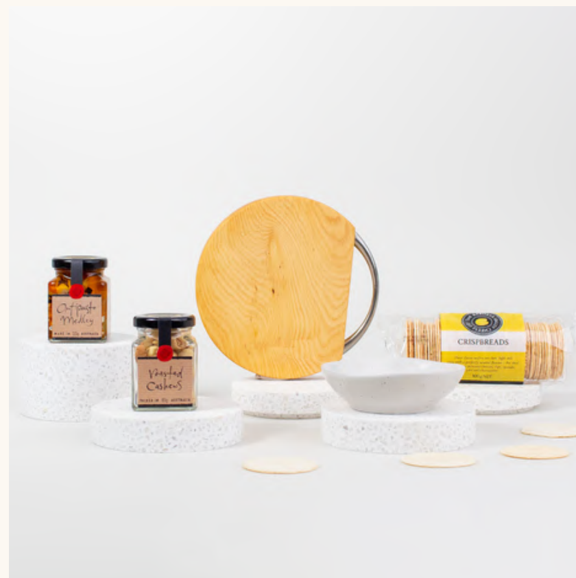
CHEESE BOARD DELIGHTS