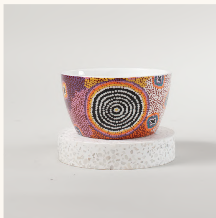
INDIGENOUS DESIGNED BOWL AUST DESIGNED IN VIC $22