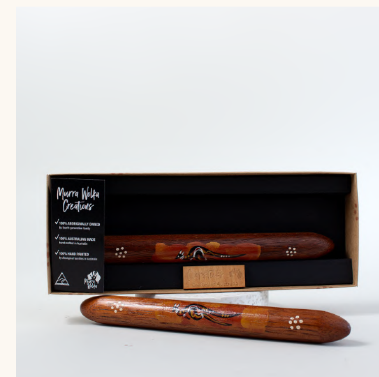
INDIGENOUS DESIGNED CLAP STICKS, AUST MADE IN QLD $45