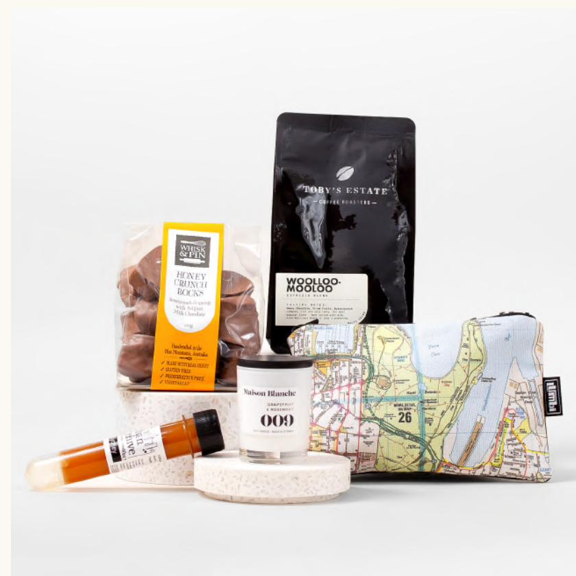
A TASTE OF SYDNEY