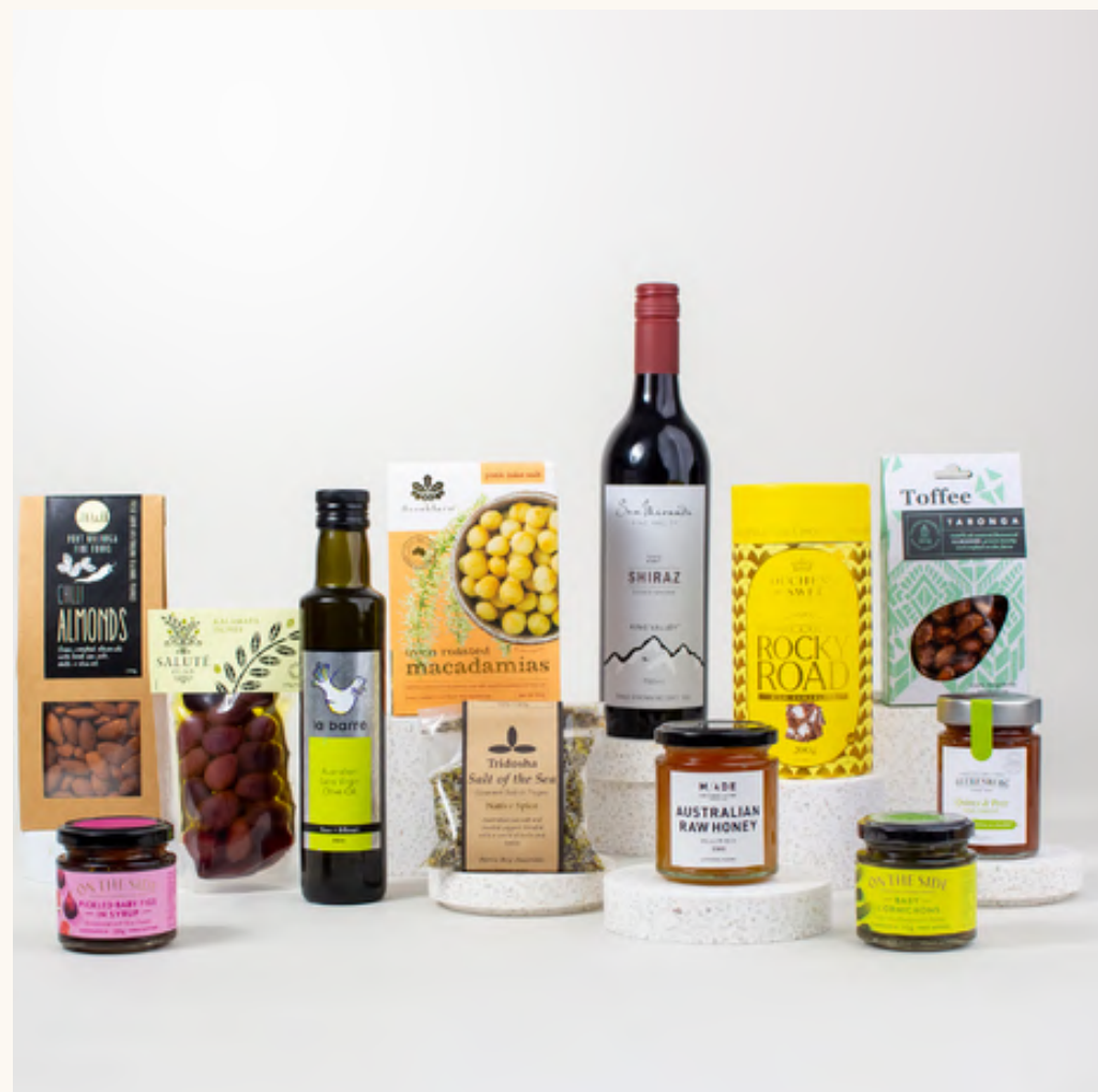
DELUX GOURMET WITH WINE