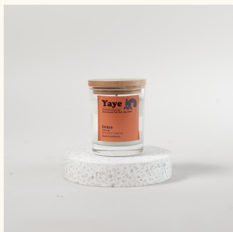
YAYE 'OCHRE' SOY WAX CANDLE AUST MADE IN NT $26