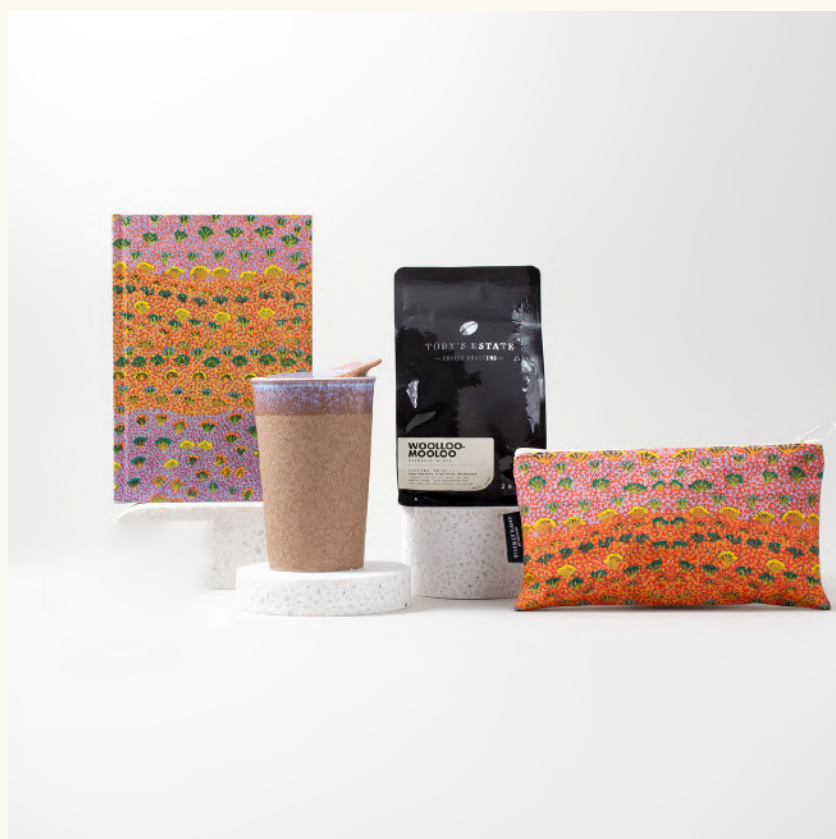
AUSTRALIAN WORK TREATS