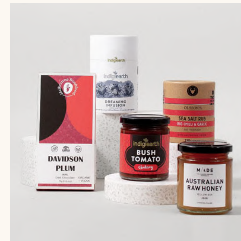
FLAVORS OF THE COUNTRY