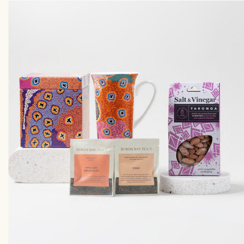
AUSTRALIAN TEA TIME