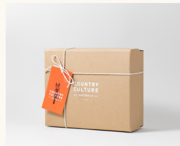
TWINE & CC GIFT TAG

We offer bespoke gifts and a personalised service that suits every budget and occasion. Our packaging is 100% Australian made and features our map of Australia tissue paper, which Aussie's adore and overseas clients appreciate.