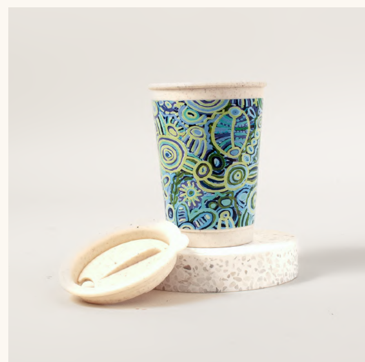
INDIGENOUS DESIGNED BAMBOO KEEP CUP AUST DESIGNED IN SA $14