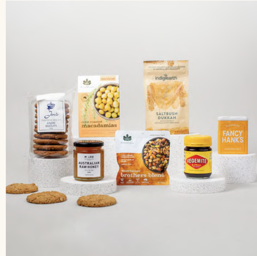
A TASTE OF AUSTRALIA