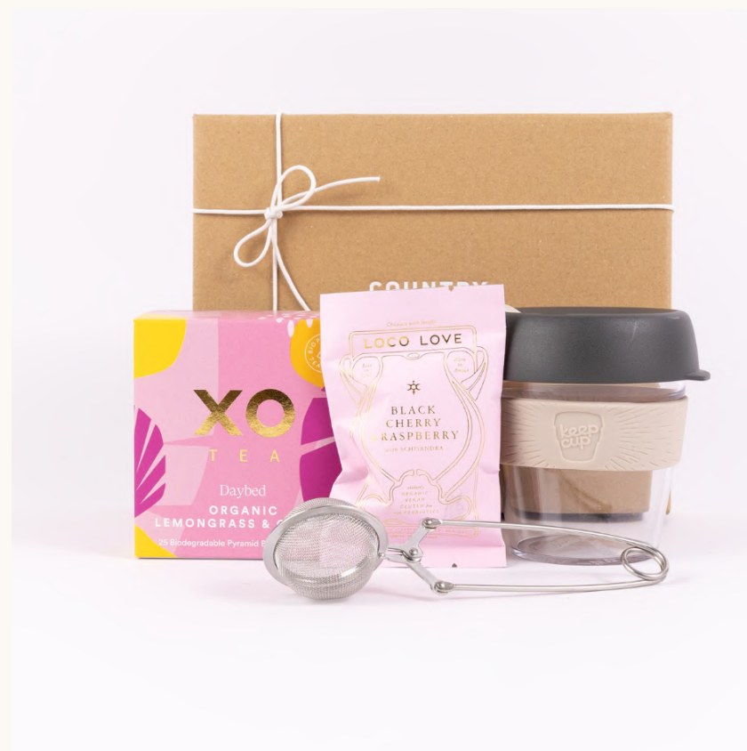
TEA TIME ESSENTIALS