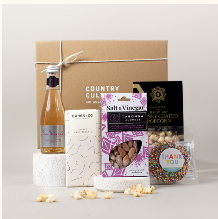
DIVINE DELIGHTS WITH PROSECCO