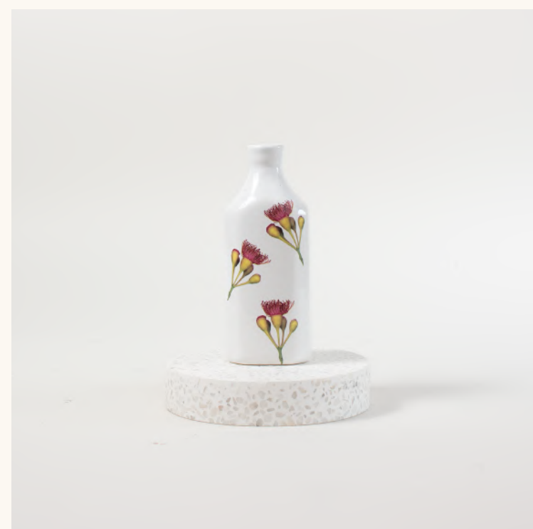
FLOWERING GUM BOTANIC PORCELAIN VASE AUST DESIGNED IN VIC $40