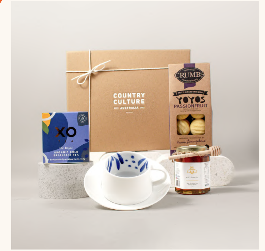
GRATITUDE TEA BOX