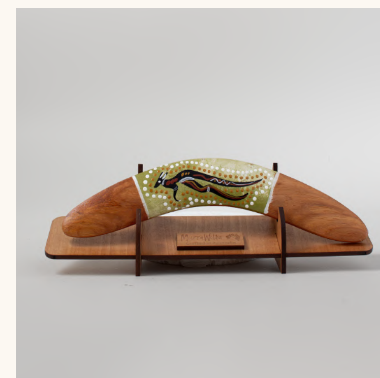
INDIGENOUS HAND PAINTED BOOMERANG AUST MADE IN QLD $48