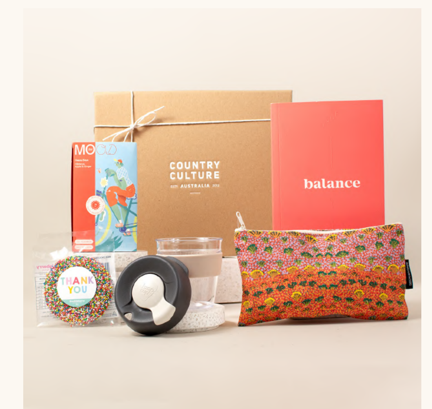
MOMENT TO YOURSELF