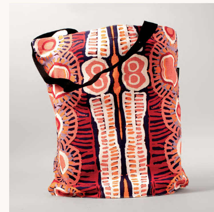
INDIGENOUS DESIGNED MURDIE TOTE BAG, AUST MADE IN VIC $34.95