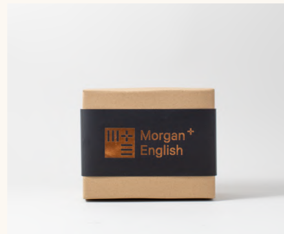
BRANDED BOX WRAP