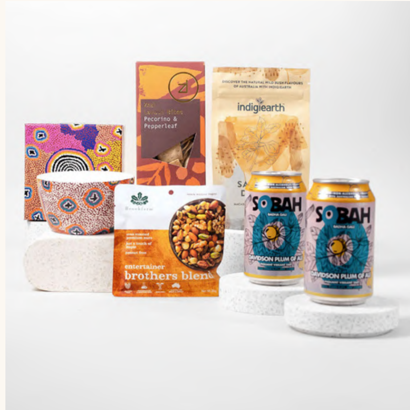
BUSH TUCKER FOOD HAMPER