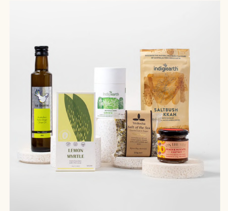
FLAVOURS OF AUSTRALIA