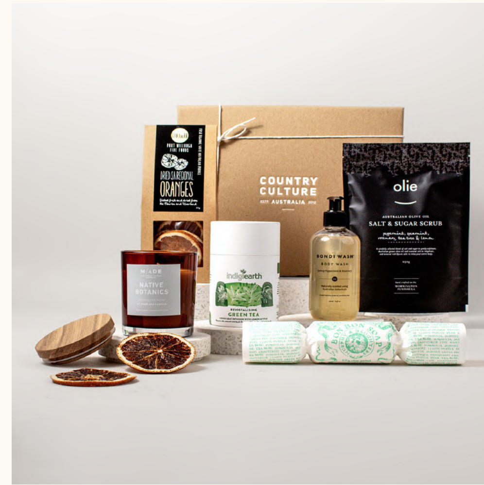
FEMALE FOUNDED WELLNESS EDITION