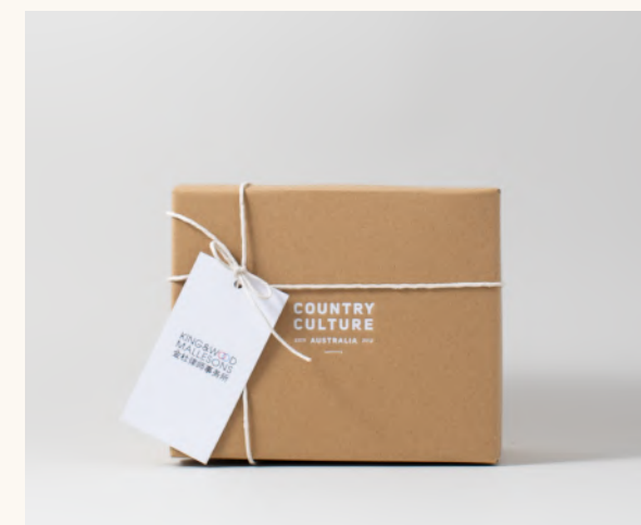
BRANDED GIFT TAG