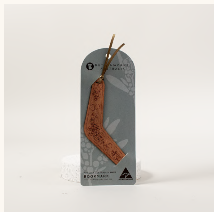
WOODEN BOOMERANG BOOKMARK AUST MADE IN VIC $13.95