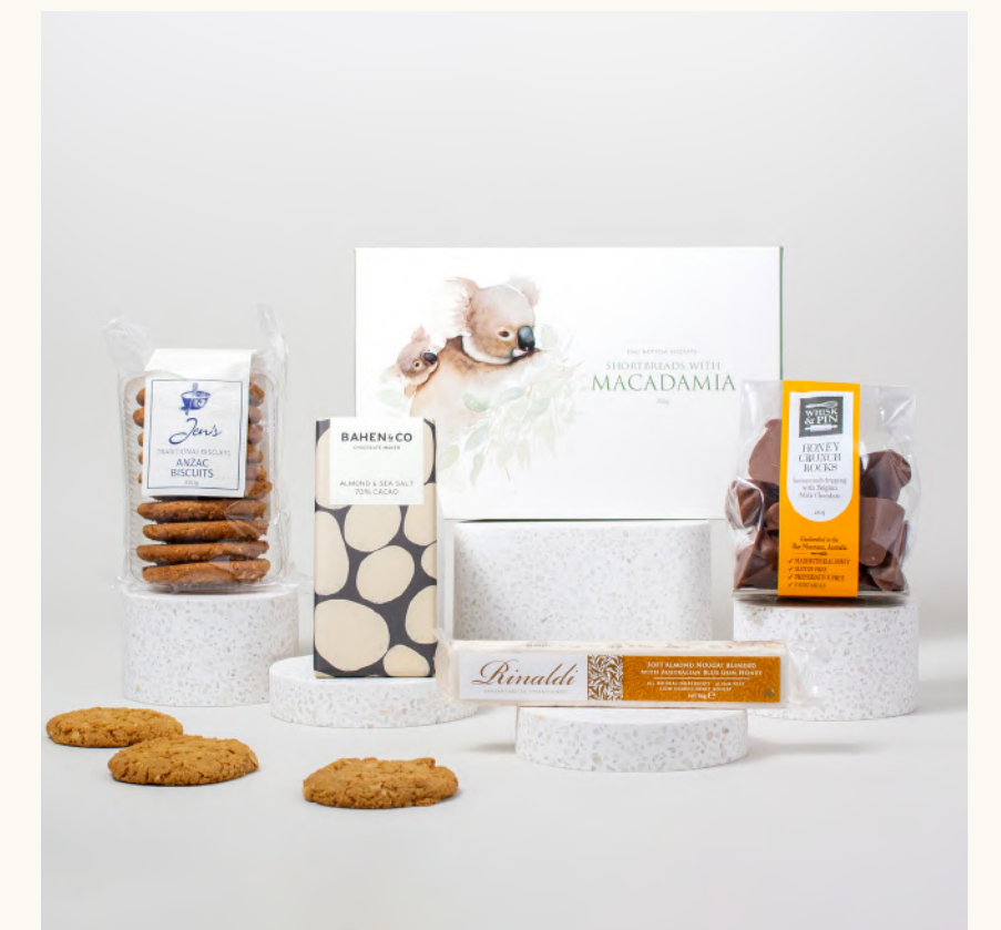
ARTISAN SWEET TREATS